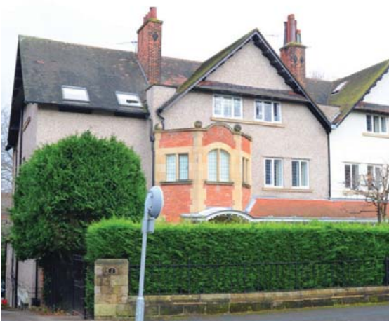
Spring Grove, Harrogate