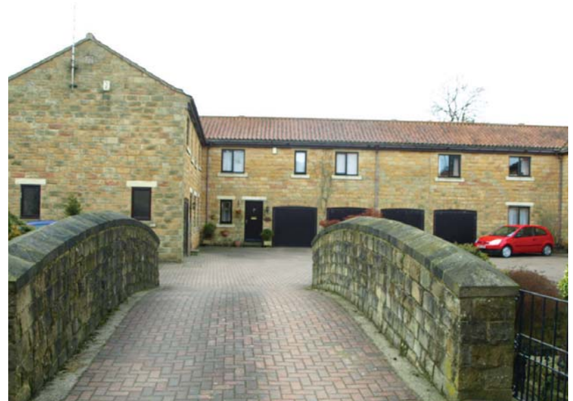
Low Mill Court, Shaw Mills