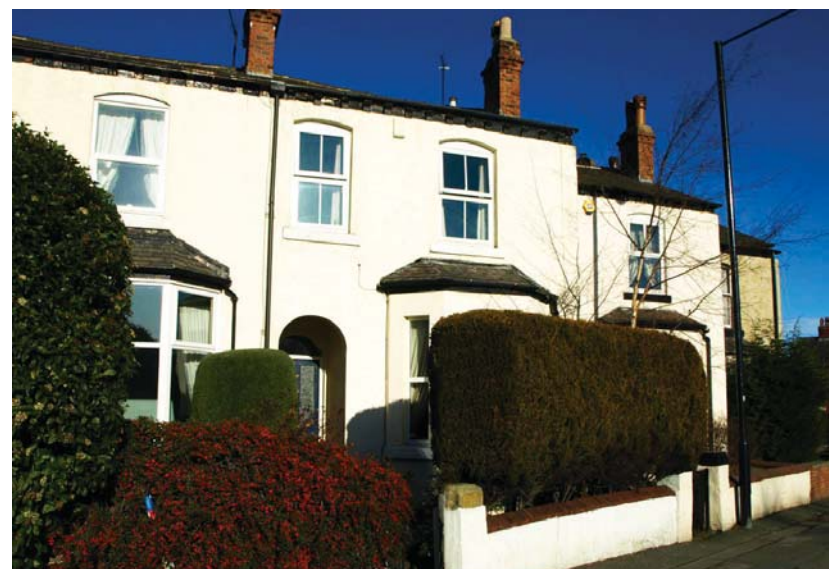
Hookstone Road, Harrogate

An immaculately presented three-bedroomed detached family house. The property enjoys occupies an elevated plot with potential for extension, with private landscaped south-facing gardens to the rear. New Price