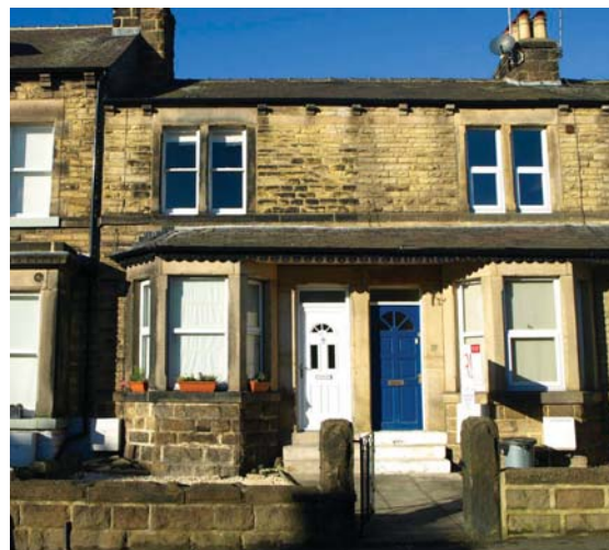
Mayfield Grove, Harrogate

A stunning 1 bedroomed ground-floor apartment. This superb apartment has undergone comprehensive refurbishment programme and has the advantage of ownership of the basement rooms. New Price