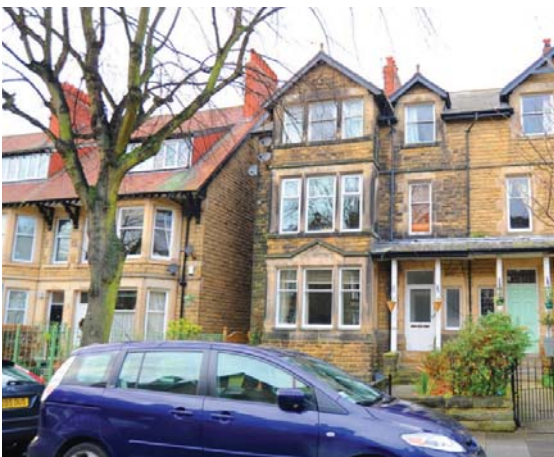
Dragon Parade, Harrogate

A spacious and well-appointed four-bedroomed mews-style cottage. Situated in an attractive courtyard development, the property enjoys delightful views over surrounding countryside and has garaging for three vehicles. New