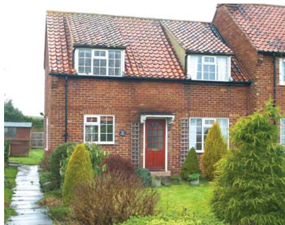
Four Winds, Goldsborough