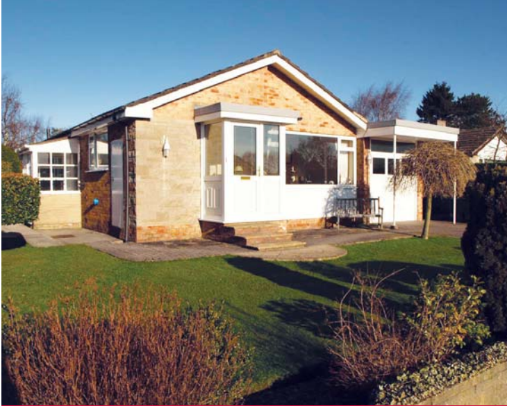
Firs View, Harrogate