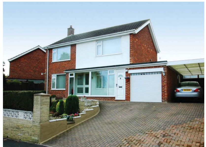
Aspin Park Crescent, Knaresborough

An attractive 2 bedroomed end cottage. Situated in the sought-after village of Goldsborough. With good sized gardens overlooking open countryside. New